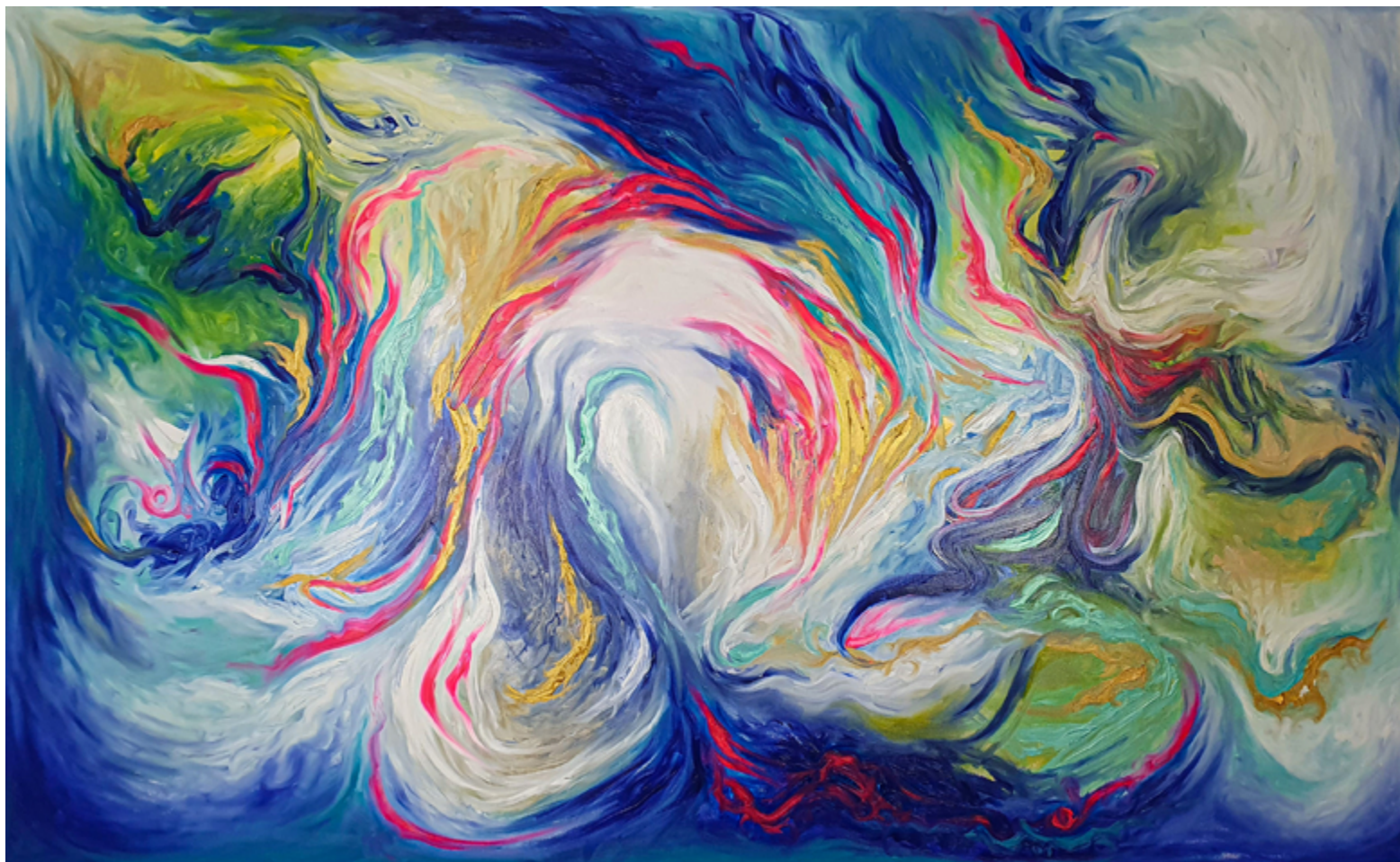
Freedom composition VI , 2020 Oil on canvas 120 x 160 cm