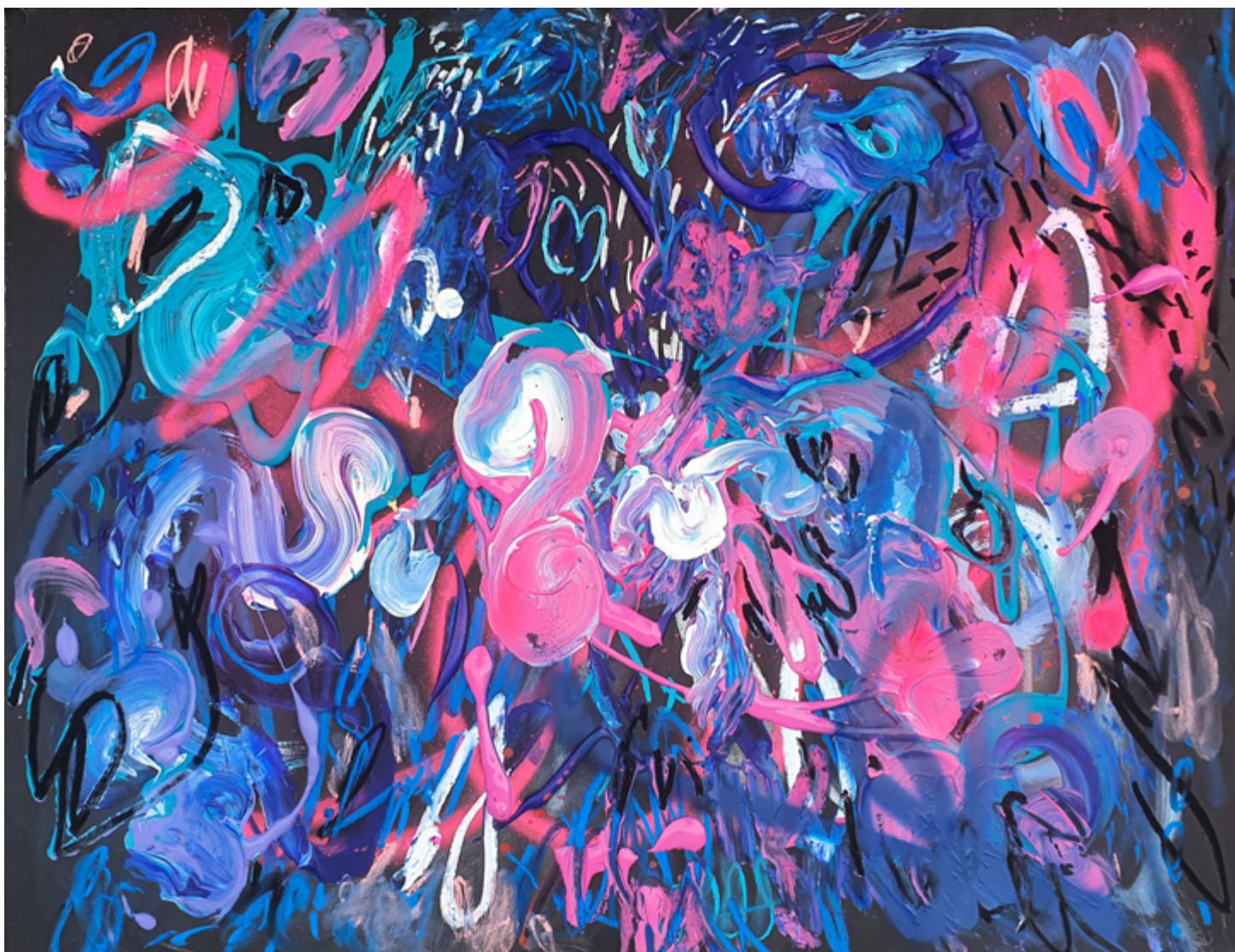
Abstract black 1, 2021 Acrylics, inks, pastels and aerosols on canson Freedom Series - 65 x 50 cm