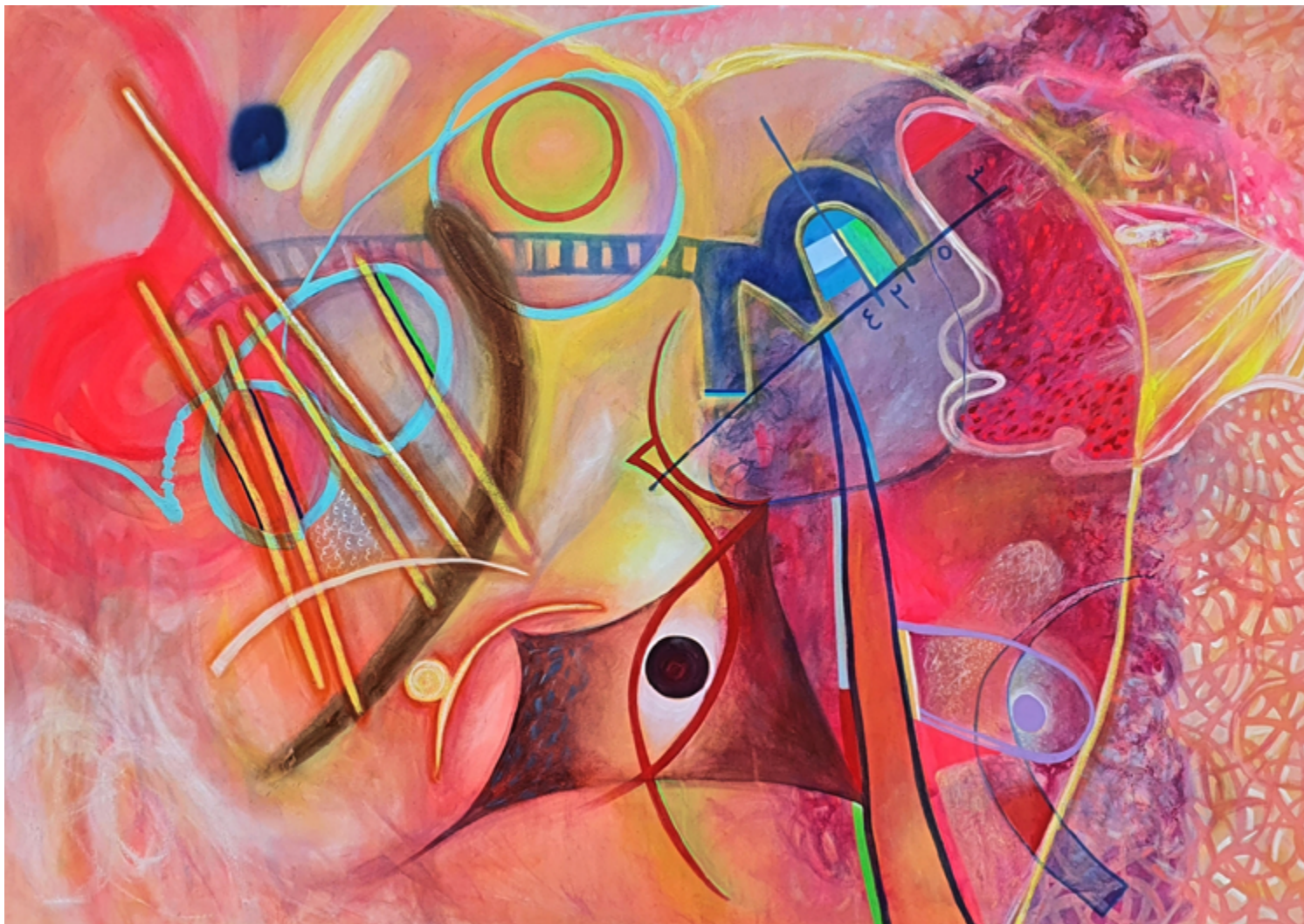
The eye from below, 2022 Acrylics, inks, pastels, and aerosols on canvas New Talisman series - 140 x 100 cm