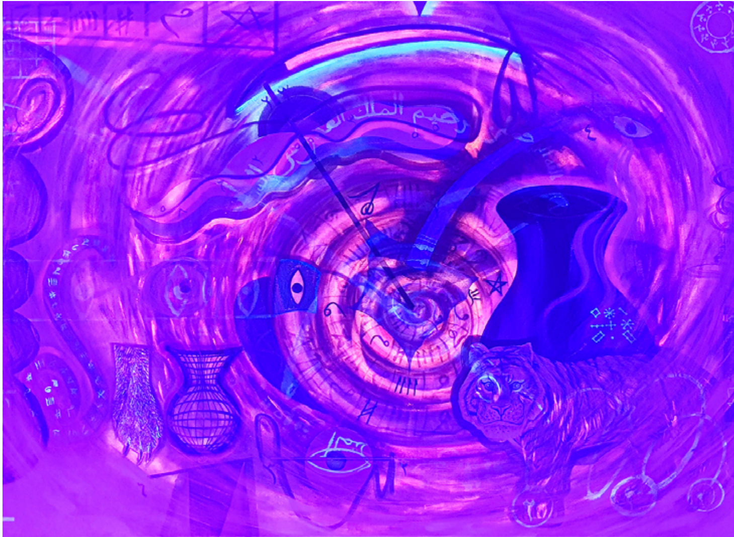
The Tiger's Dream , 2022 Acrylics, inks, pastels, embroidery, gold leaf and aerosols on canvas New Talisman series - 140 x 100 cm