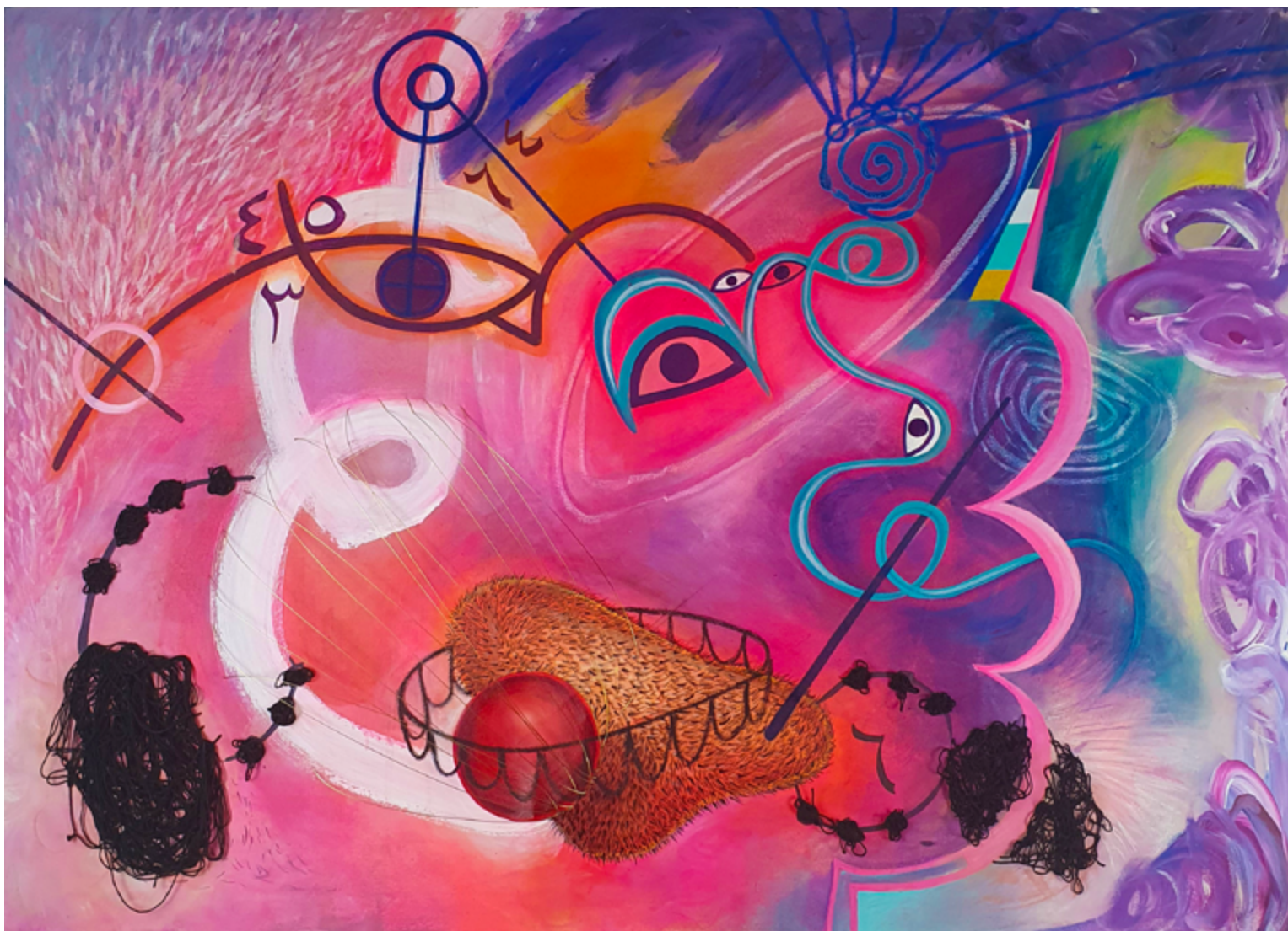
Big bang, 2022 Acrylics, inks, pastels, embroidery and aerosols on canvas New Talisman series - 140 x 100 cm