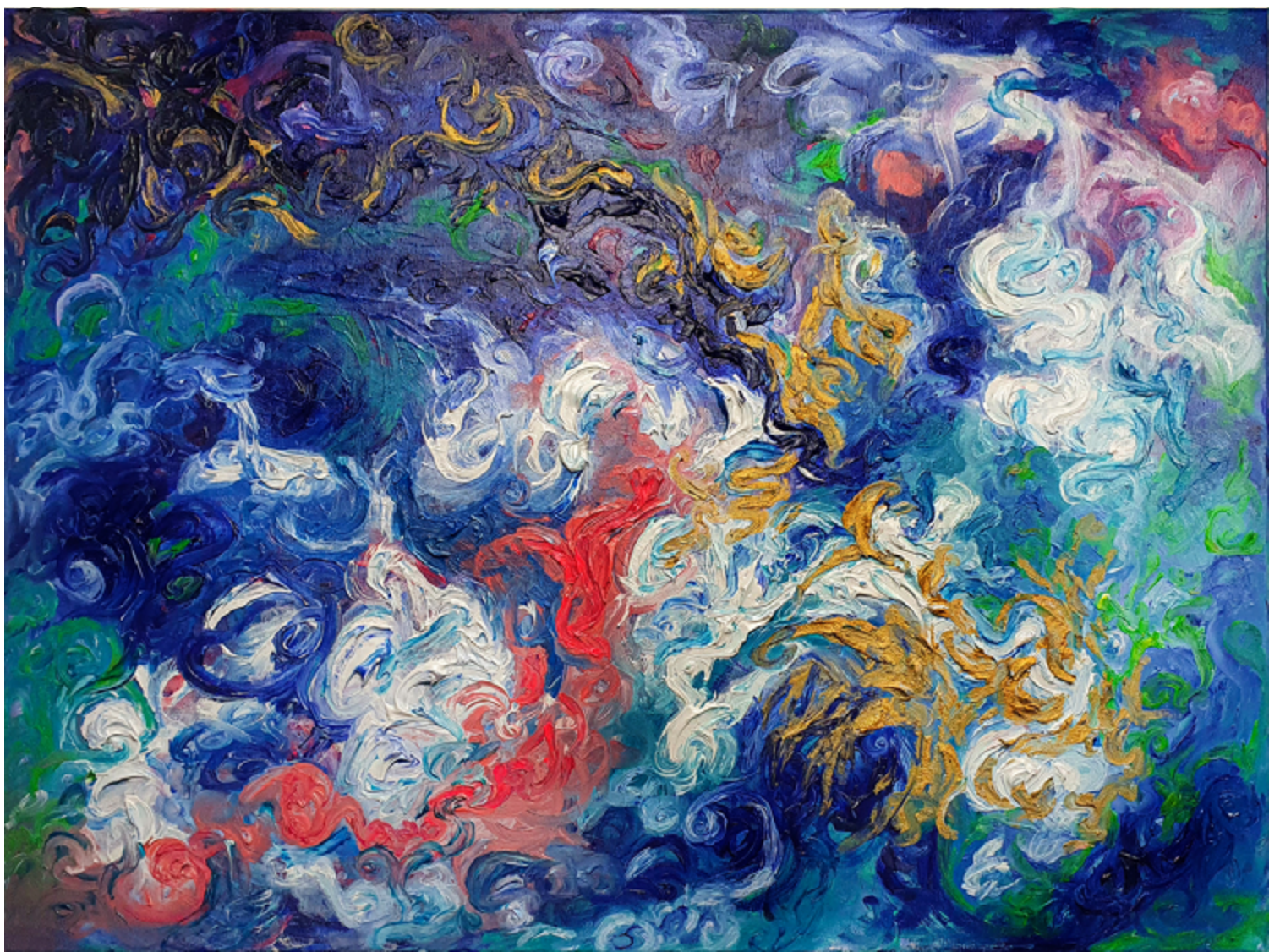
Genesis , 2021 Oil on canvas 80 x 100 cm