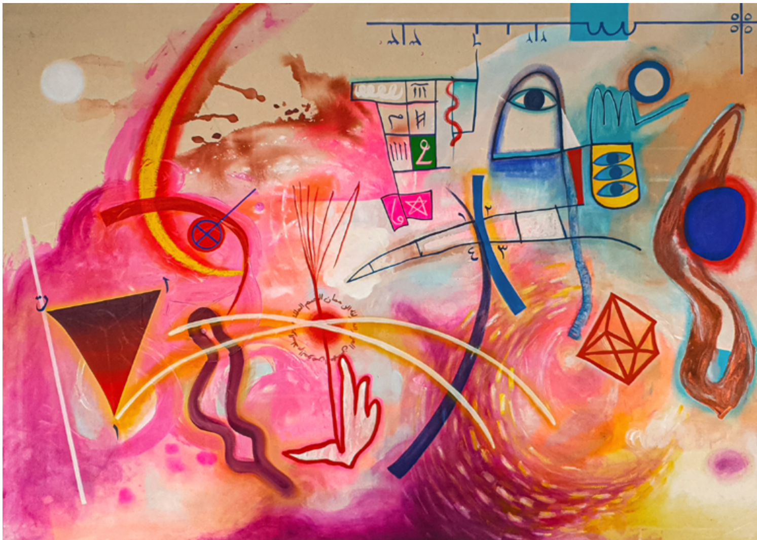
Fragile balance , 2022 Acrylics, inks, pastels, and aerosols on canvas New Talisman series - 140 x 100 cm