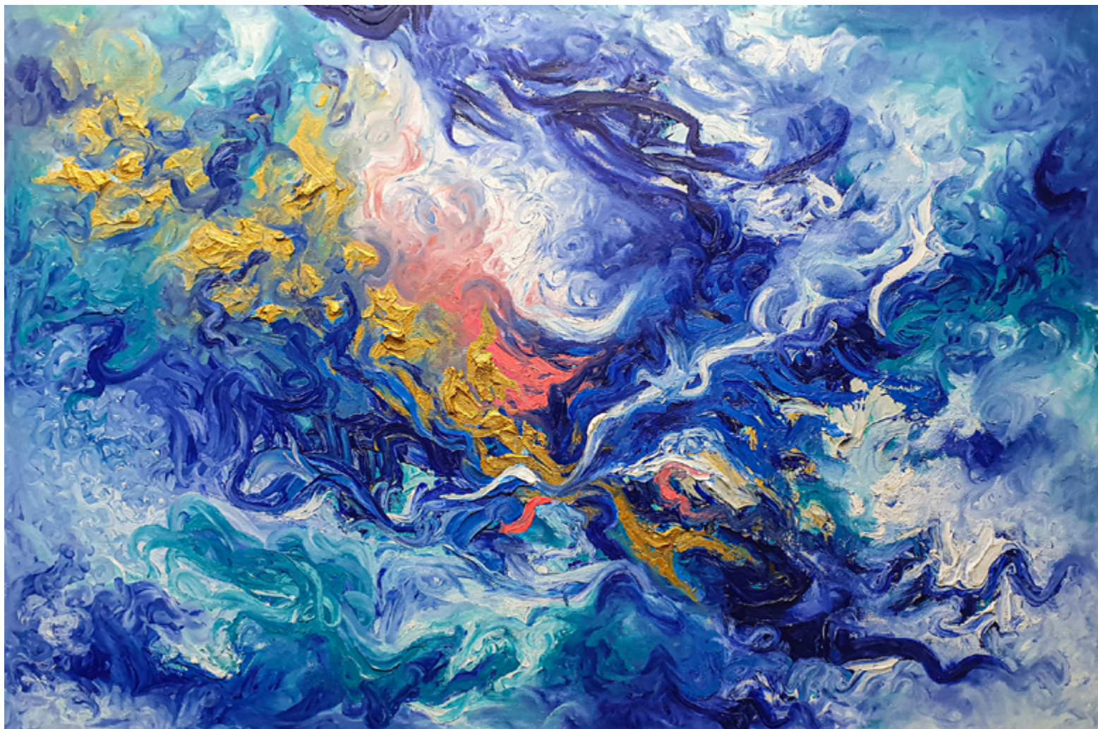
Lightning , 2021 Oil on canvas 90 x 60 cm