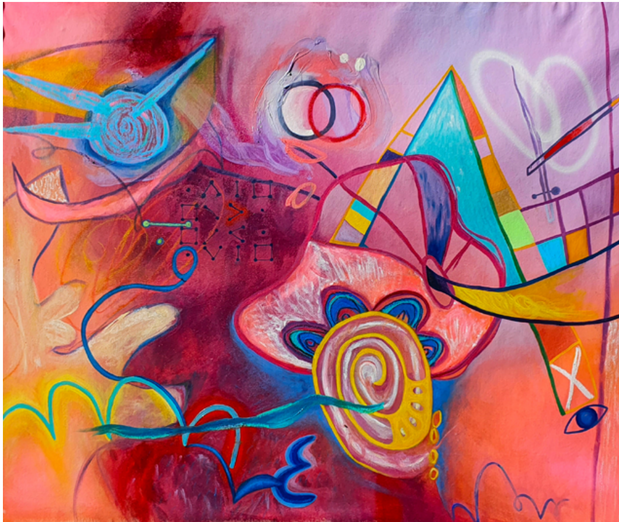
Talisman 10 , 2022 Oils, Acrylics, and aerosols on canvas New Talisman series - 120 x 100 cm