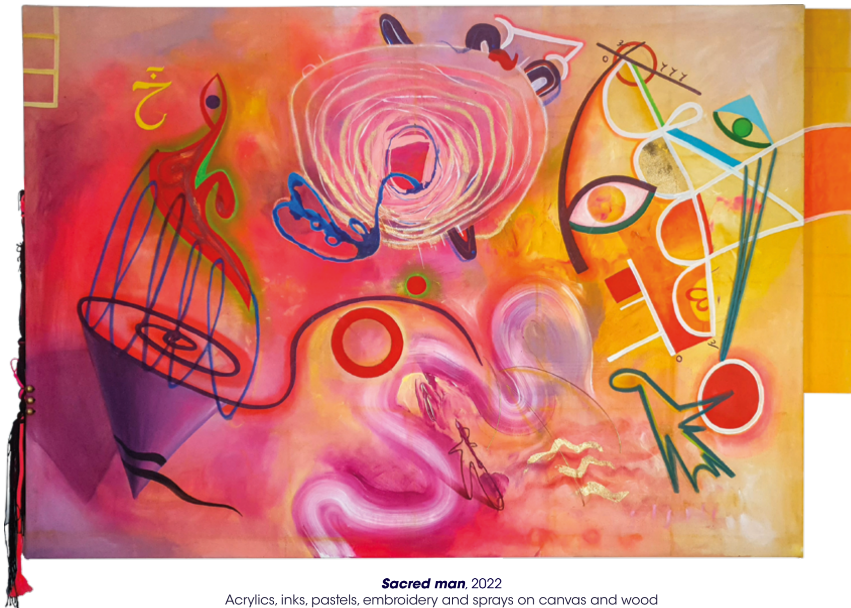
Sacred man, 2022

Acrylics, inks, pastels, embroidery and sprays on canvas and wood New Talisman Series - 140 x 100 cm