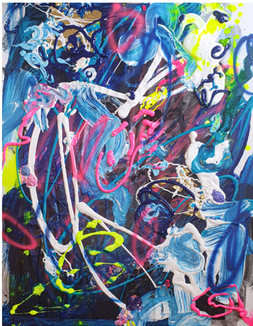
Tupac Abstract , 2021

Acrylics, photo collage, gold leaf and aerosols on canvas 90 x 60 cm