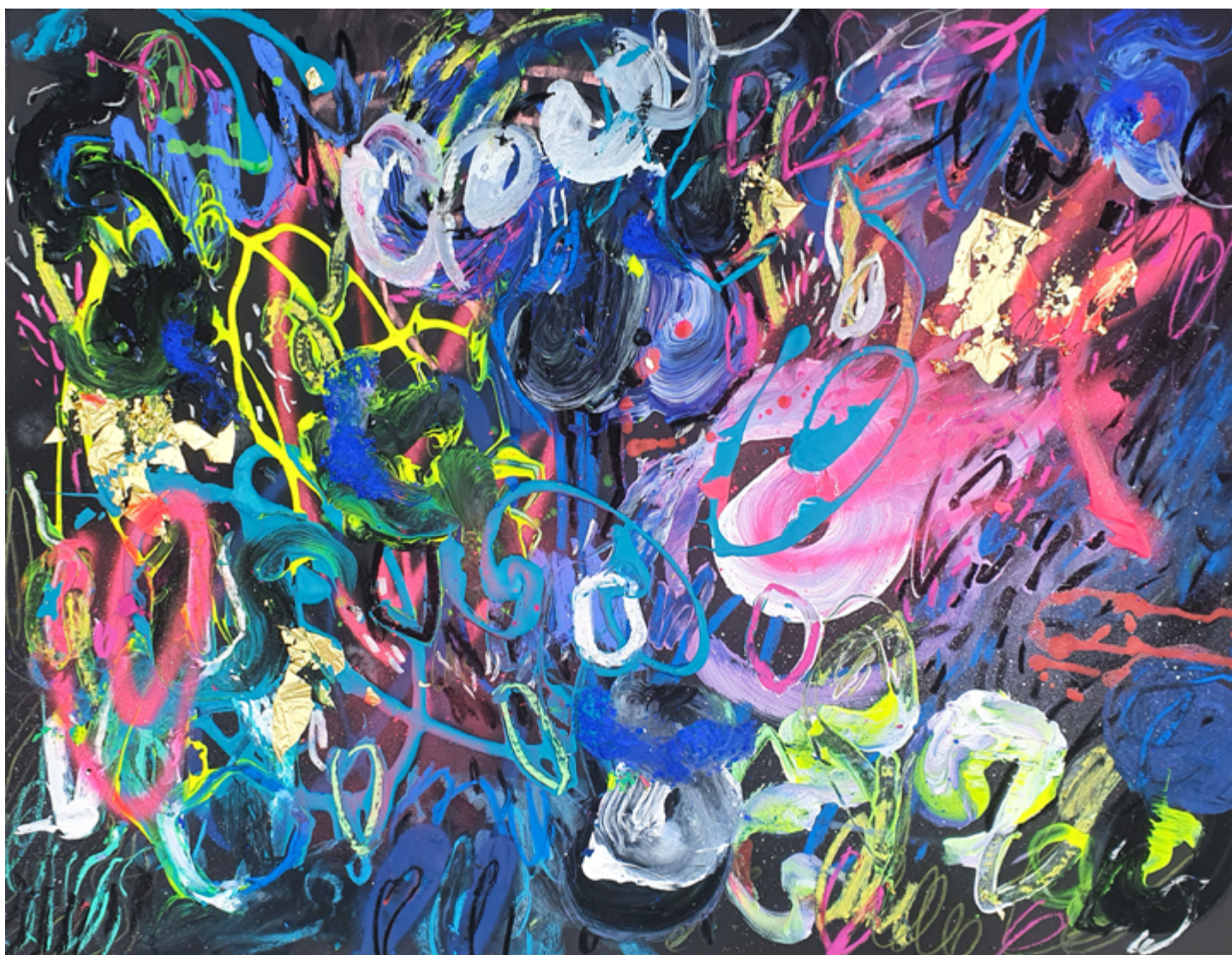
Abstract black 2, 2021 Acrylics, inks, pastels and aerosols on canson Freedom Series - 65 x 50 cm