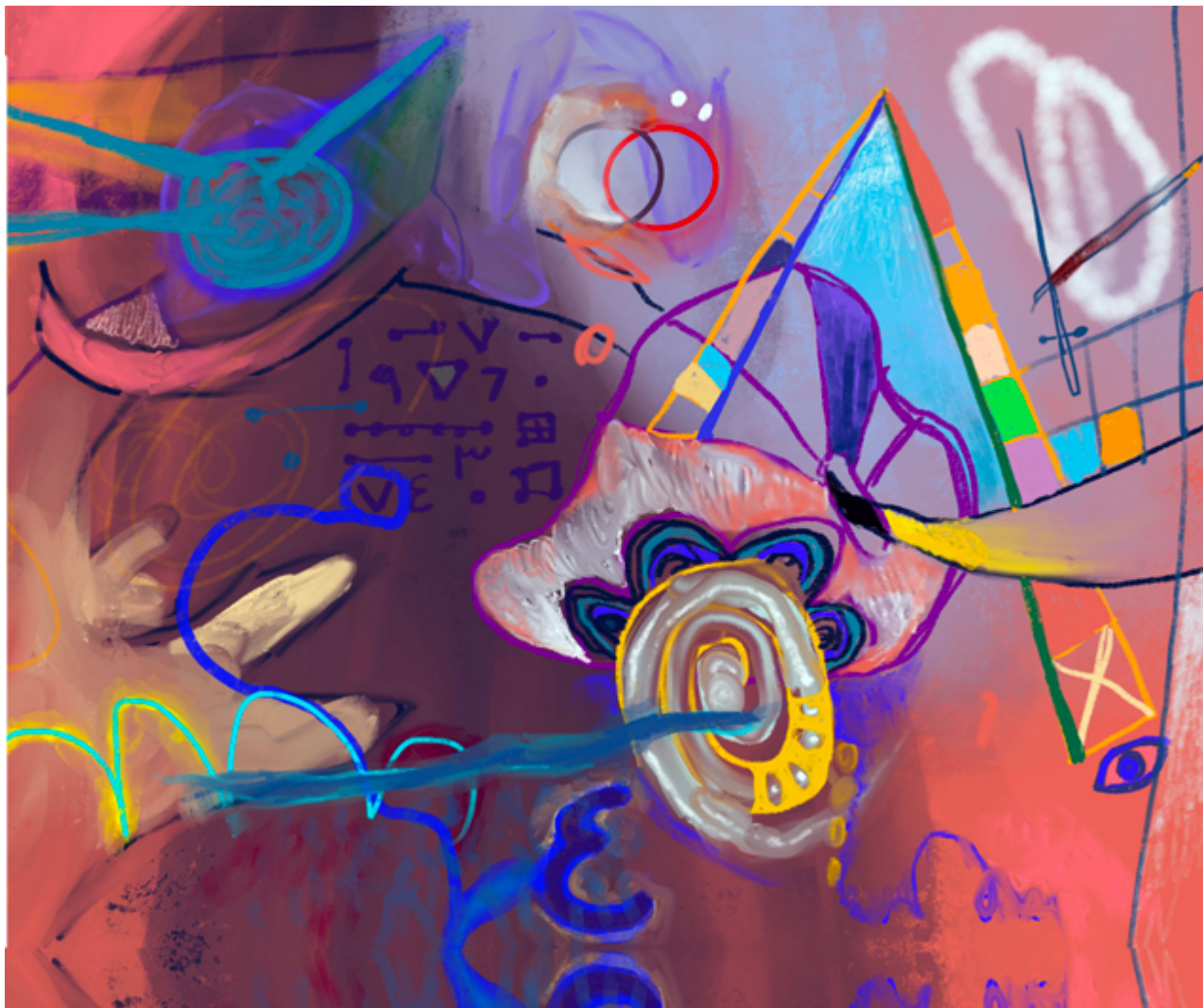
Talisman 10 , 2022 digital painting New Talisman Series - 7074 x 5877 px