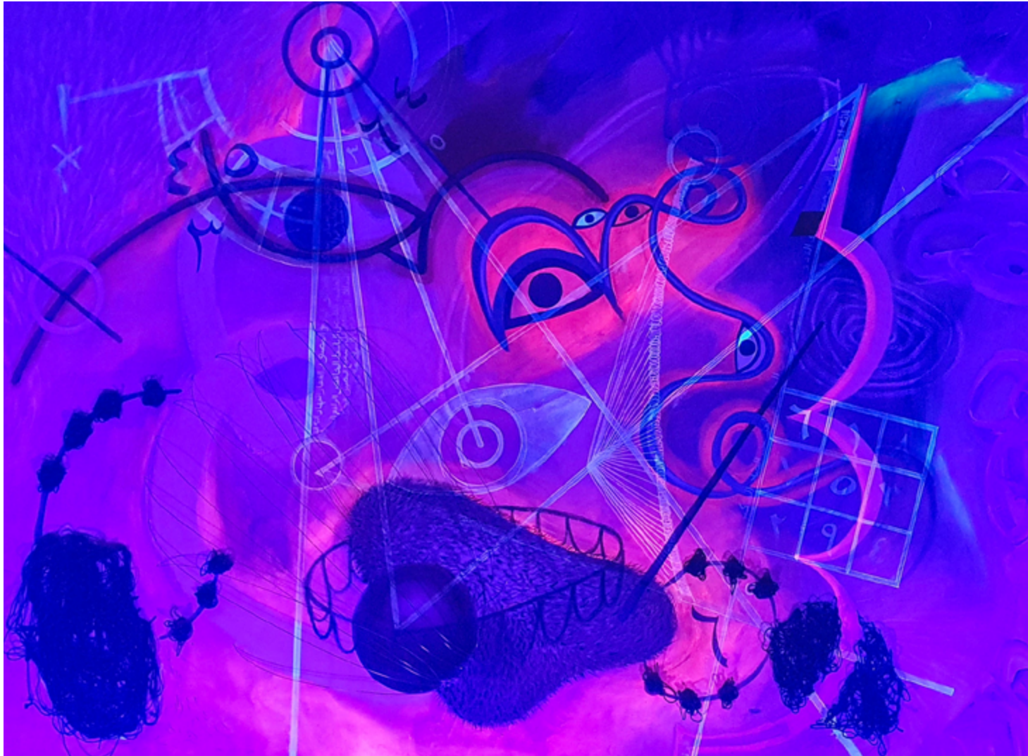
Big bang, 2022 Acrylics, inks, pastels, embroidery and aerosols on canvas New Talisman series - 140 x 100 cm