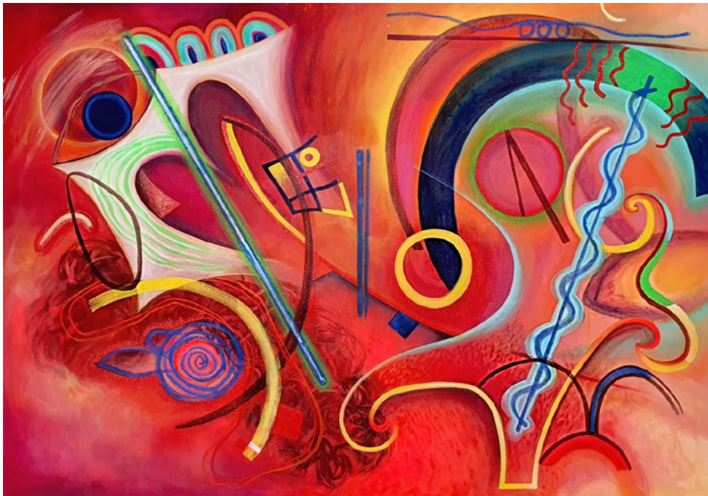
Third eye , 2022 Acrylics, inks, pastels, and aerosols on canvas New Talisman series - 140 x 100 cm