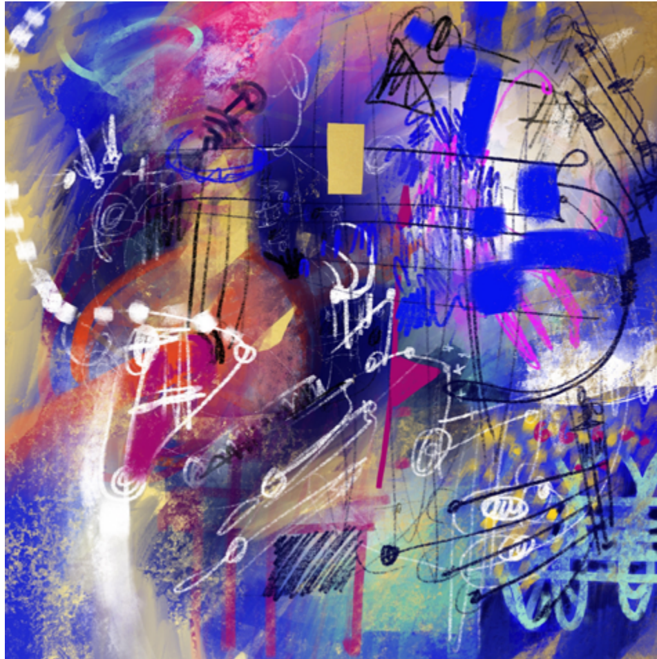
Overseas paradigm 1 , 2020