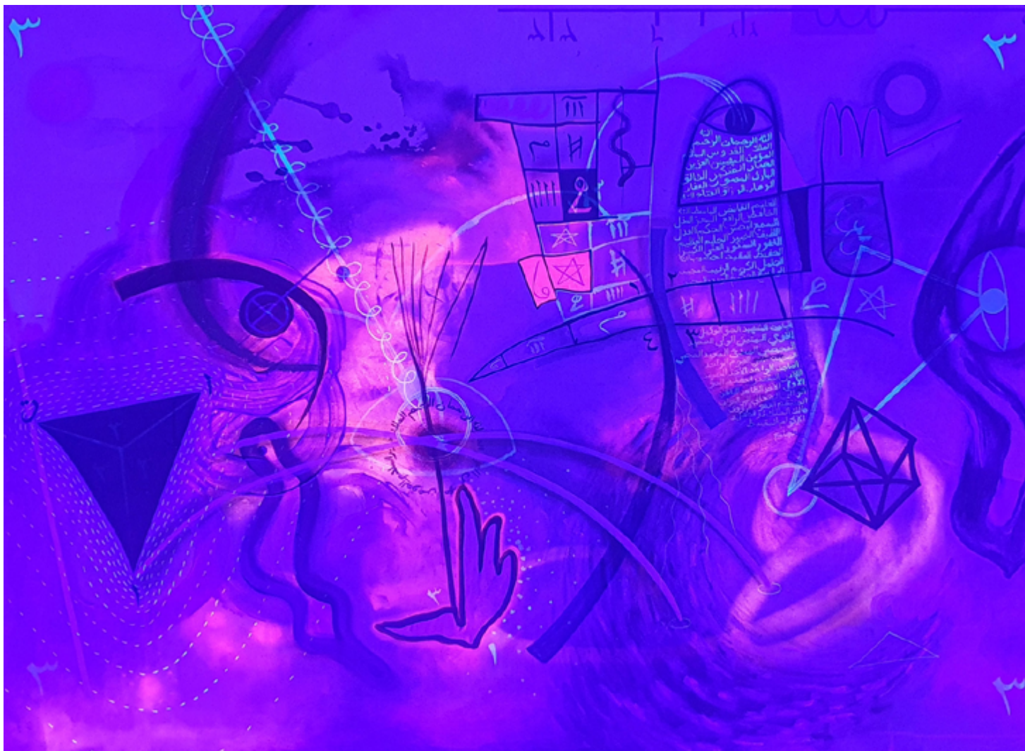
Fragile balance , 2022 Acrylics, inks, pastels, and aerosols on canvas New Talisman series - 140 x 100 cm