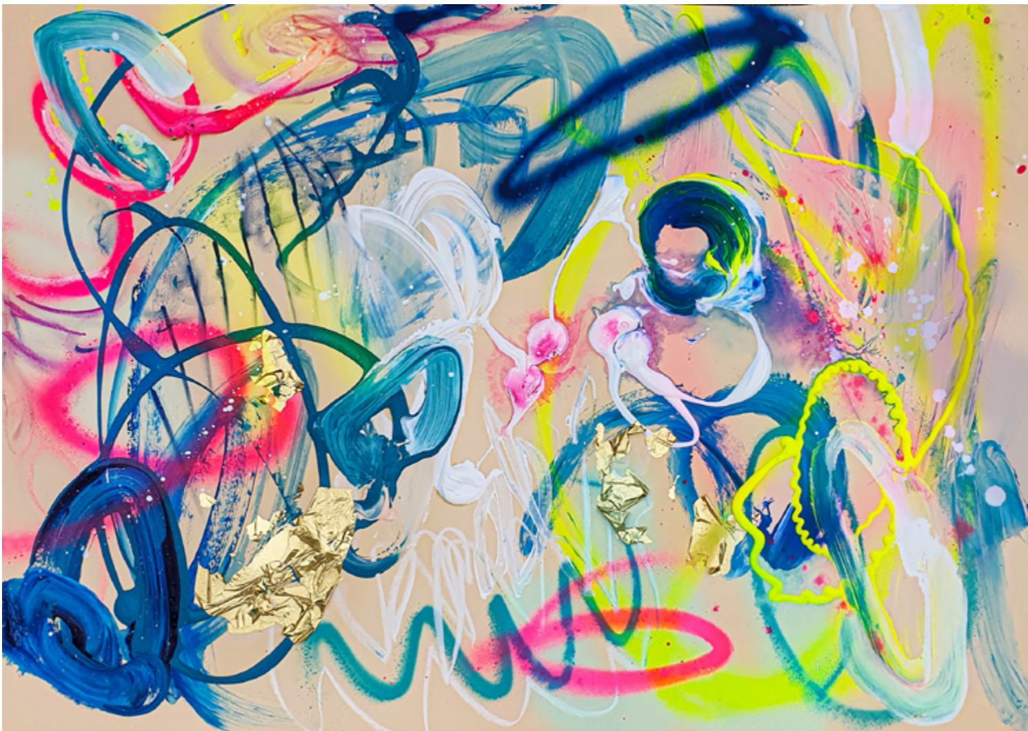
Abstrait sable , 2021

Acryliques, encres, pastels, feuilles d'or et aérosols sur canson 65 x 50 cm